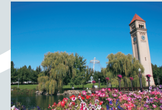
Clock Tower and Pavilion