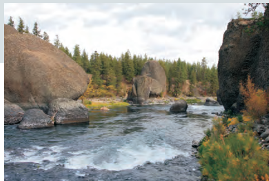
Rock formations on the Spokane River