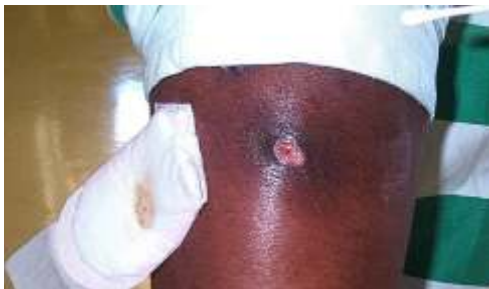
Taking care of a MRSA wound.

People who have MRSA should be especially careful around those with weak immune systems, such as newborn babies, elderly persons, and anyone with a chronic disease, skin condition, or recent surgery. If they get a MRSA infection, it can make them very ill.