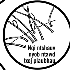
Nqi ntshauv nyob ntawd txoj plaubhau