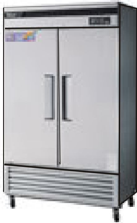
Refrigerator or walk-in cooler