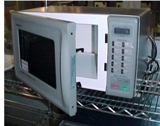
Microwave (continue cooking process after thawed)